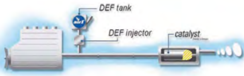
Air1® is a registered trademark of Yara International ASA. Produced by Yara.