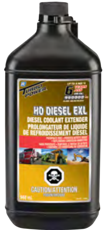
Diesel Coolant Extender Every 480,000 km 960,000 km or 6 years